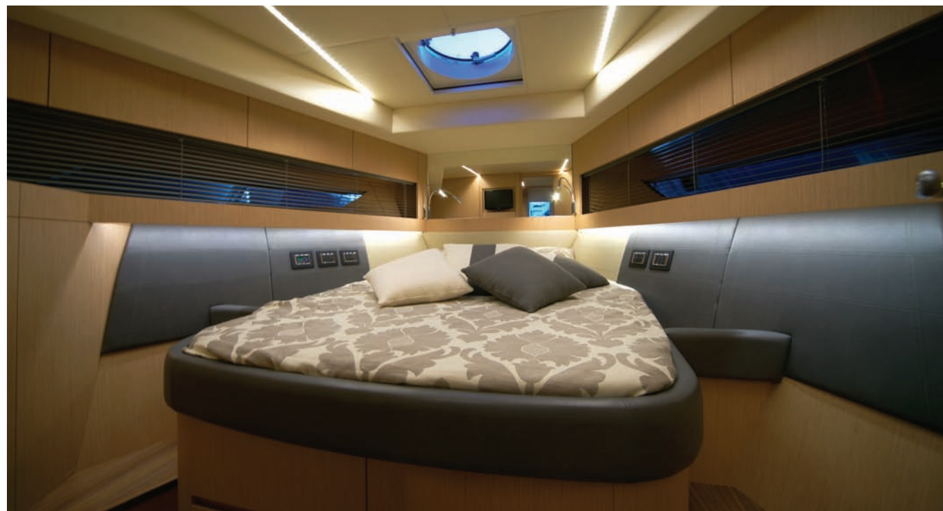
(Above) For her size, the 42 has excellent use of indoor space, including this secondary saloon, where the boat's entertainment system resides. (Below) There's lots of light and a big berth in the master. You won't fail to get a good night's sleep on this baby.

EDITOR'S CRUISING PICK: The Austin Parker 42 looks at home at nearly any dock from Boca to Boothbay, but we wouldn't mind taking this Down East-inspired beauty back home to the Italian waters in which she was born. A few weeks harbor-hopping in the Mediterranean? We'll see you quayside. But enough about us, where would you like to cruise the Austin Parker 42? Like us on Facebook and let us know.