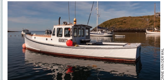
ONNE VAN DER WAL

The classic lobster boat has been described as the "pickup truck of the Maine coast," so it's no surprise that boatbuilders have been quick to claim their offerings are "lobster yachts," no matter what their design credentials.