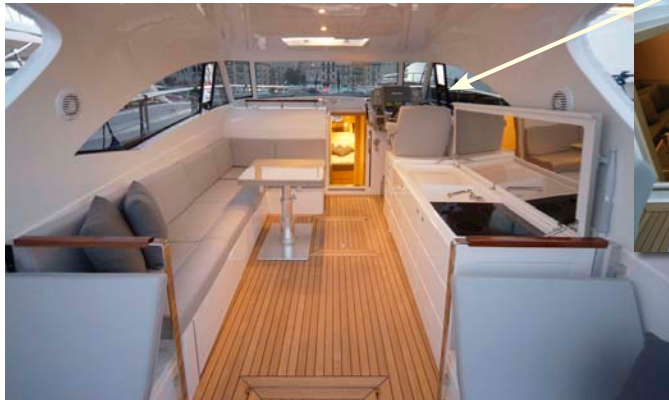
Note the lack of steps (above). The helm (inset) is tidy and neat.